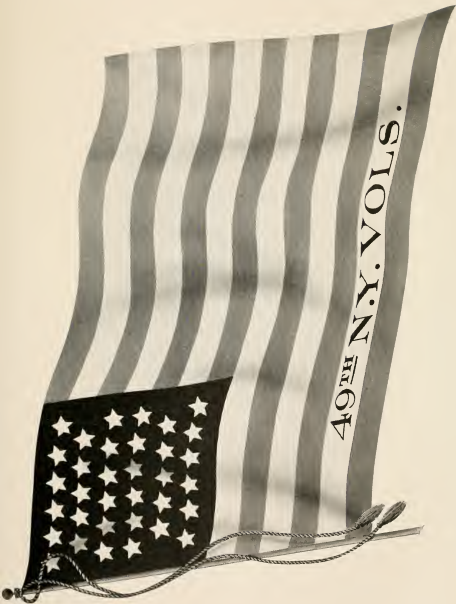
Flag Presented to the 49th Regiment, New York Volunteers, by the Patriotic Ladies of Buffalo