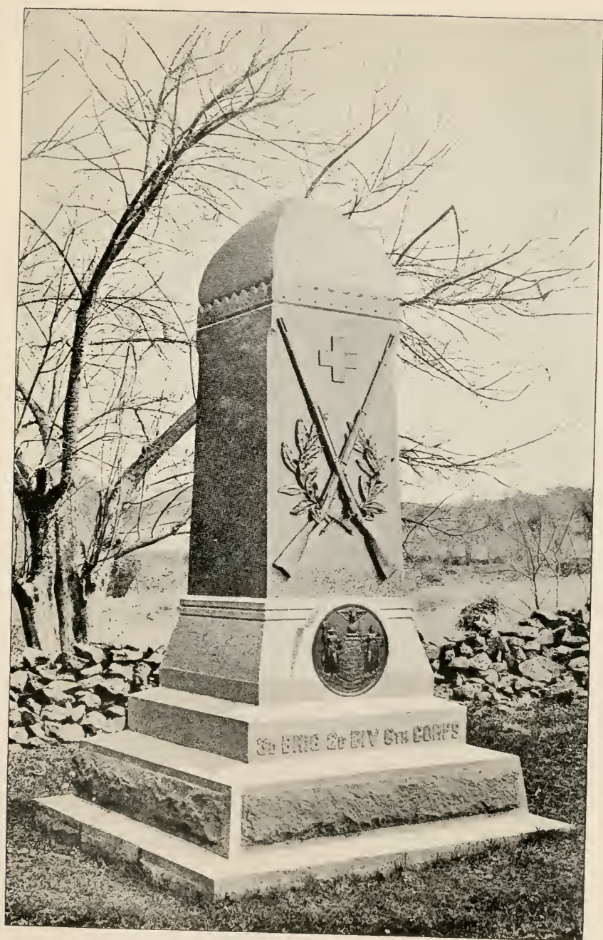
Monument Erected upon the Gettysburg Battlefield by the State of New York for the 49th Regiment, New York Volunteers