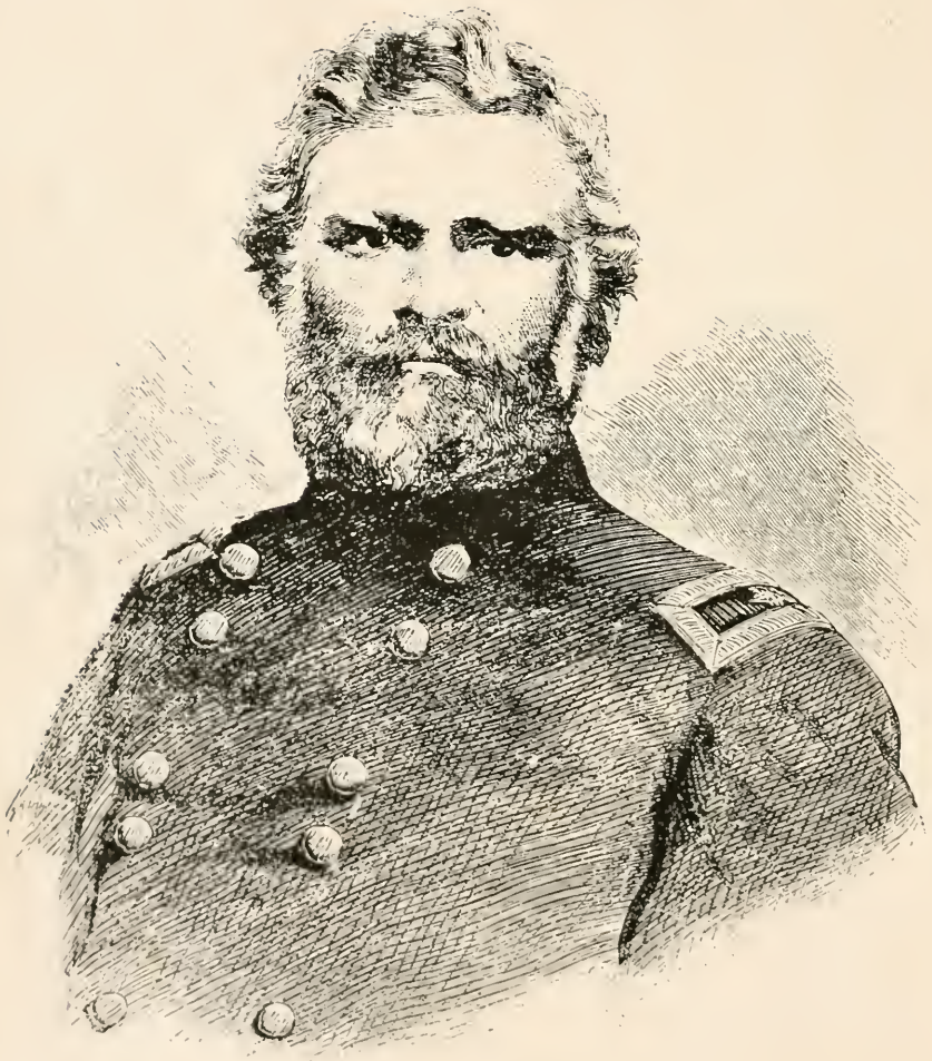
GENERAL DANIEL DAVIDSON BIDWELL