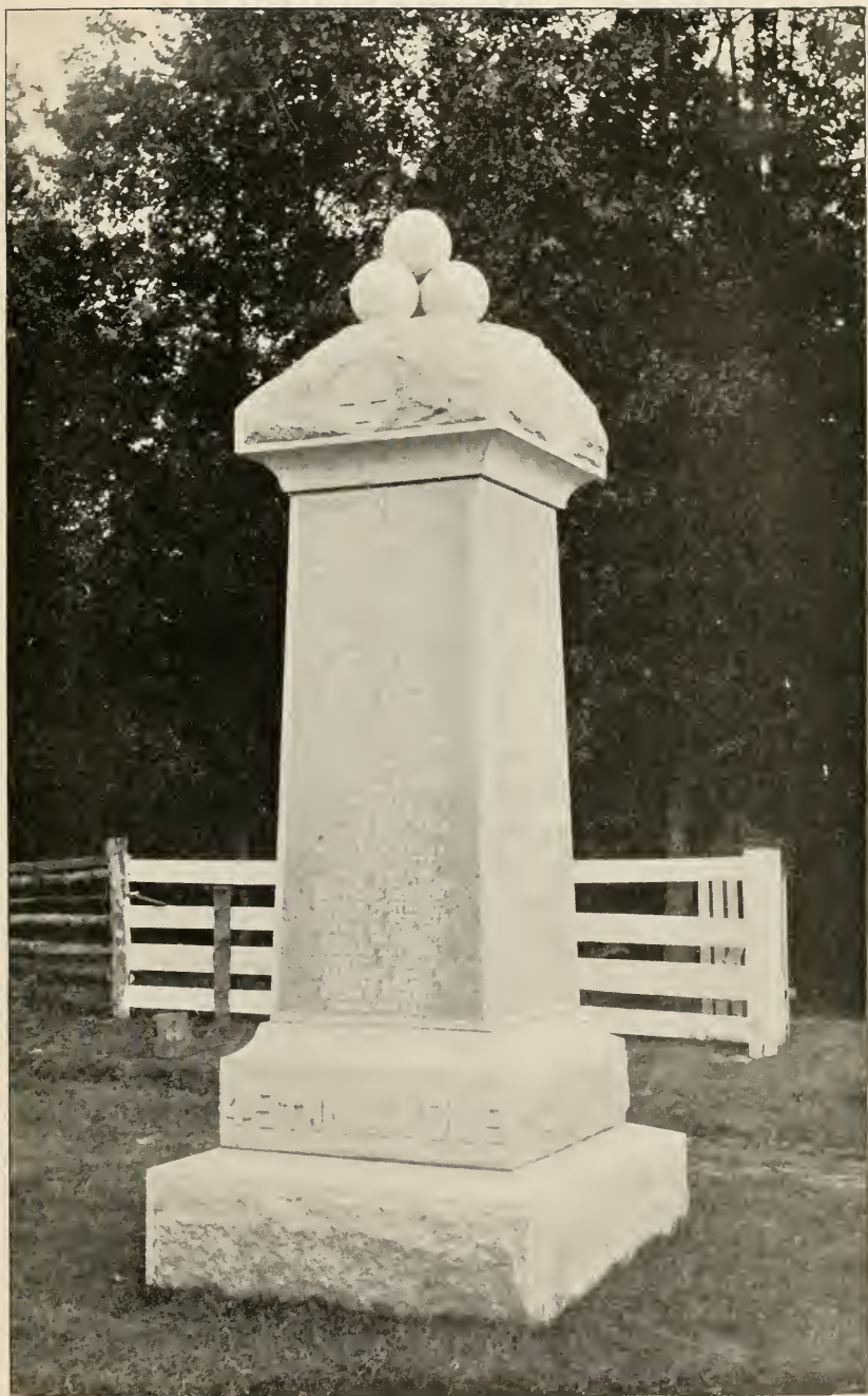
Monument Erected at the Bloody Angle by the Survivors of the 49th Regiment, New York Volunteers