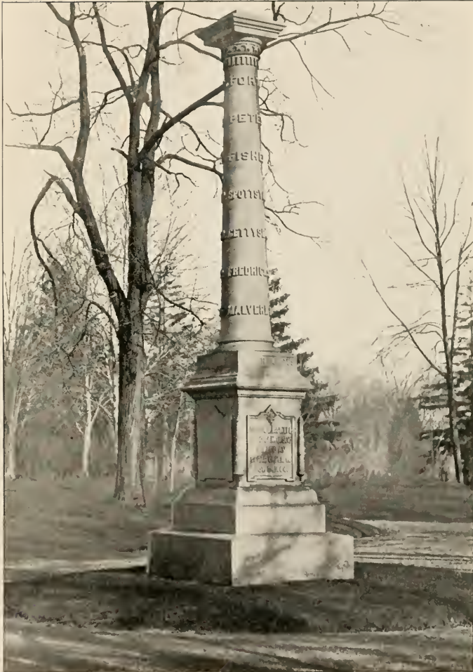
General Bidwell Monument in Forest Lawn Cemetery, Buffalo, New York