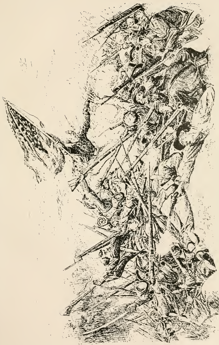
STRUGGLING FOR THE WORKS AT THE "BLOODY ANGLE"